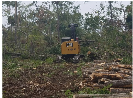
A contractor works to clear the south end of Diamond Roof Road using retained receipts from stewardship contracts on the National Forest.

For areas damaged on the Forest outside of existing timber sales, the Forest is actively reviewing these areas to determine if the completed environmental analysis is adequate to address the change conditions following the storm event and/or what level of additional analysis would be needed under the National Environmental Policy Act (NEPA).