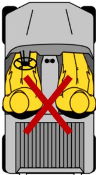
Non-straddled seat [bench/bucket style]