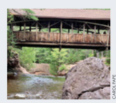
Amnicon Falls State Park

Universe in the Park programs are a great way to learn about the night sky. The programs are scheduled at parks around the state, with Friends Groups often planning additional outings to coincide with these events. Activities throughout summer include campfire talks, singalongs, visits by Smokey Bear and music performances. Friends members may even perform themselves! At park campgrounds, extra help with these events and other park projects comes from camparound hosts, who are available to make sure campers enjoy their stay.