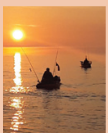
Harrington Beach State Park

Autumn is in full swing in October, and there is no better time to take some amazing photographs of Wisconsin's state parks and forests at peak color. Nature centers are busy with family-friendly activities, and Friends Groups also hold many programs to celebrate fall and Halloween. There may be candlelight hikes with trails lit by jack-o-lanterns, non-scary night events and more. With two full moons in October 2020, it's the only month of the year with a "blue moon," which just so happens to be on Halloween!