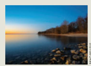
Harrington Beach State Park

Friends members and volunteers help park staff with a variety of spring cleaning projects, including repairing fences, cleaning up park grounds and trail maintenance. The Friends also make information signs for parks and assist with carpentry projects such as building birdhouses, constructing kiosks, and repairing benches and picnic tables. Many Friends Groups cut and stock firewood for sale to park visitors, with proceeds going back to the parks.