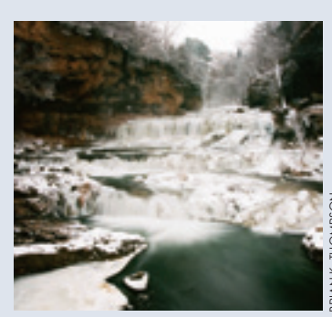
Willow River State Park

Friends Groups sponsor many winter candlelight events. These popular activities may include lighted trails for cross-country skiing, snowshoeing and hiking. There are usually fires for warming up and the Friends Groups often sell concessions, with proceeds benefiting the parks. All winter long, the Friends may help with cross-country ski clinics, races and other special events, and assist park staff in grooming trails.