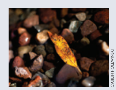
Brule River State Forest

Friends raise money for matching funds so they can apply for grants through the state's Knowles-Nelson Stewardship Program to help with work including habitat restoration, trail maintenance and the construction of park facilities. Past projects from Friends Groups have included the construction of shelters, playground equipment, boardwalks, trails, accessible cabins and interpretive exhibits, as well as invasive species removal and restoration of prairie and woodland habitat. Nov. 15 is the deadline for applying for Friends stewardship grants.