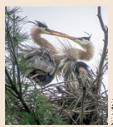
Devil's Lake State Park

The Friends of Wisconsin State Parks and Wisconsin State Park System staff would like to thank all the Friends, campground hosts and volunteers who have pitched in at parks throughout the year. These dedicated supporters help to enhance the state parks experience in countless ways and make a visit to our great state parks, trails, forests and recreation areas special for everyone!