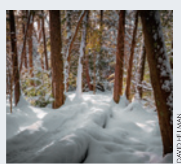
Logan Creek State Natural Area

The Friends of Wisconsin State Parks offer a convenient way to purchase state park admission stickers and state trail passes as part of gift packages through the online store at FWSP.org. You also can renew your membership or join a Friends Group near you. January is a great time to head "OutWiGo" and enjoy winter — and it's never too early to start taking photos for FWSP's annual photo contest!