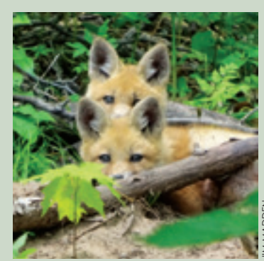
Governor Dodge State Park

May is a popular time for school field trips to state parks. It's also when the Friends of Wisconsin State Parks announce winners of incentive grants awarded to local Friends Groups to support naturalist programs. The grants help to provide new educational materials at parks and nature centers. In addition, the Friends help at parks by presenting programs, conducting workshops and leading guided nature walks for school groups and other visitors.