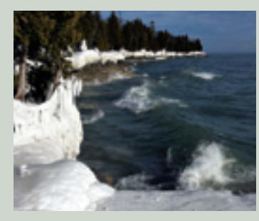
Whitefish Dunes State Park

Just in time for the holidays, the Friends of Wisconsin State Parks offer online sales of state park admission stickers and state trail passes as part of gift packages through the Friends online store found at FWSP.org. December also is the perfect time to join or renew your membership with the Friends of Wisconsin State Parks. A list of all local Friends Groups is on the back of this calendar. We hope to see you in 2021!