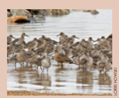
Lakeshore State Park

FWSP hosts several Work*Play*Earth Day events in April and May, and this year's Earth Day is extra special — the 50th anniversary! Volunteers at Earth Day events help the parks by cleaning up picnic and campground areas, planting trees, clearing park trails and removing invasive species such as garlic mustard. The Friends Groups typically provide lunches to say thanks to everyone who has volunteered for the day. Trail-building crews also are out getting the park trails ready for summer users. Many volunteers even "adopt a trail" and do regular trail work throughout the year.