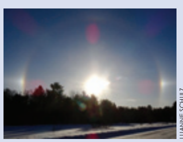
Northern Highland-American Legion State Forest

The Friends of Wisconsin State Parks offer a convenient way to purchase state park admission stickers and state trail passes as part of gift packages through the Friends online store at FWSP. org. You also can renew your membership or join a Friends group near you. January is a great time to take photos for FWSP's annual photo contest or to check out a candlelight ski or hike.