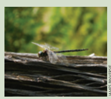
Peninsula State Park

In May, the Friends of Wisconsin State Parks announce the winners of the Incentive Grants, which are awarded to local Friends groups to support naturalist programs. The grants help provide new educational materials at parks and nature centers. May also is a popular time for school field trips, and the Friends help the parks by presenting programs, conducting workshops and leading guided nature walks for school groups.