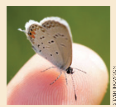
Havenwoods State Forest

Wisconsin's state parks, forests, recreation areas and trails are popular places for special events such as marathons, bike competitions, triathlons and endurance races. Friends groups help park staff plan and organize these events. The end of August also brings the FWSP photo contest to a close. Don't miss your chance to submit your best photos or to vote for your favorite parks for FWSP's Gold Seal awards. Winning photos appear in the FWSP annual calendar.