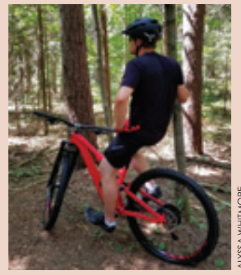
Newport State Park

During summer, Universe in the Park programs are scheduled at parks around the state for learning about and viewing the night sky. Friends groups often plan additional events to coincide with these programs, including nightly campfire talks, singa-longs and visits by Smokey Bear. The Friends may bring in singers and musicians or even perform themselves. Campground hosts help with these events and other park projects and are available to make sure campers enjoy their stay.