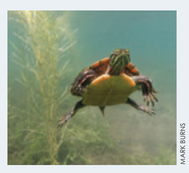
Hartman Creek State Park

During summer, many Friends groups sell concessions and rent canoes, kayaks, boats and bicycles at the parks. Firewood and ice also are often sold by the Friends with proceeds staying at the property. If you're exploring the parks and need equipment or supplies, make sure to stop by the park concessions. Wisconsin's state parks and forests also offer many reservable shelters and are popular places to hold family reunions, birthday parties and weddings