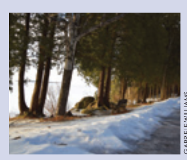
Peninsula State Park

Just in time for the holidays, the Friends of Wisconsin State Parks offer online sales of state park admission stickers and state trail passes as part of gift packages through the Friends online store at FWSP.org. December also is the perfect time to join or renew your membership with the Friends of Wisconsin State Parks. A list of all local Friends groups is on the back of this calendar. We hope to see you in 2020!