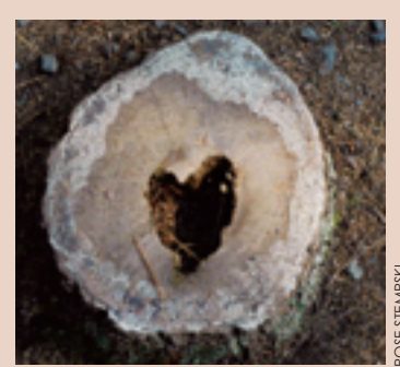
Amnicon Falls State Park

Friends groups sponsor many winter candlelight events. These may include lighted trails for classic- and skatestyle cross-country skiing, snowshoeing and hiking. There are usually fires for warming up and the Friends groups may sell concessions with proceeds benefiting the parks. The Friends also may help put on cross-country ski clinics, races and other special events and assist park staff in grooming trails.