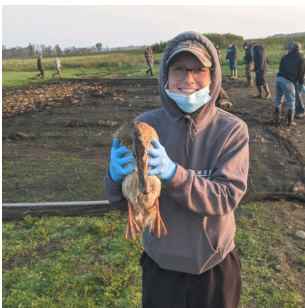
Duck banding at Collins Marsh