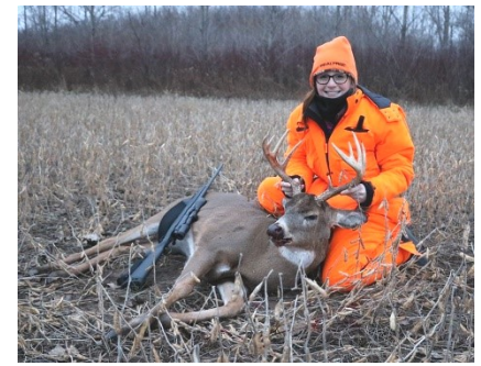
2019 deer hunting season

I have enjoyed this program so much and wish I had joined earlier. I have met so many people and made many new friends.