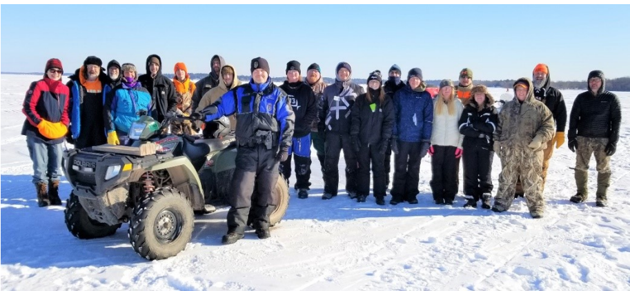
All YCC participants, mentors, parents, and guests