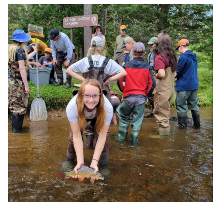
YCC summer program on the Namekagon River