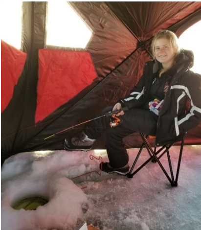
Ava, waiting patiently for a bite