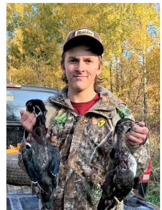
Fall duck hunting