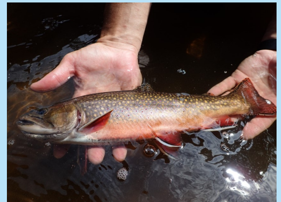
Figure 1. Brook trout captured in a DNR fisheries survey.