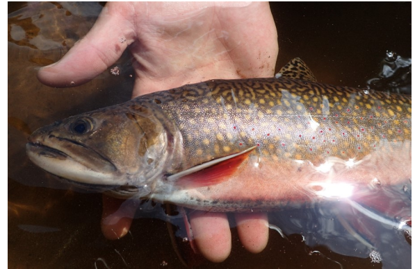
Figure 2. Brook trout captured in a DNR fisheries survey.