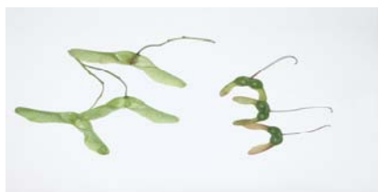
Norway maple Hard (Sugar) Maple

When collecting Hard Maple (Sugar), be sure that the seed is not Norway. The photo below shows both type seeds, Hard maple on the right and Norway Maple on the left. When seed is ripe, it can be shaken from the tree. 50% good seed can be expected. On the good seed, the embryo should be fully developed and fill the seed coat. Cut open the seed to check.