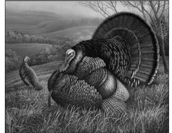
2007 Turkey Stamp Art by Samuel Timm