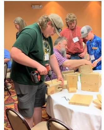
YCC delegates and mentors assembling bluebird nest boxes at the 2022 WCC Statewide Convention.