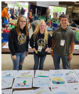
Reviewing duck stamp art entries