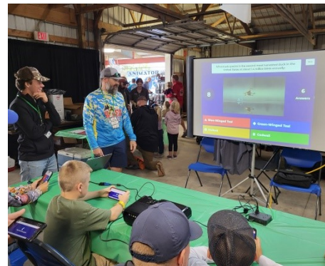
The live trivia “Kahoot” competition was a popular station at the youth zone