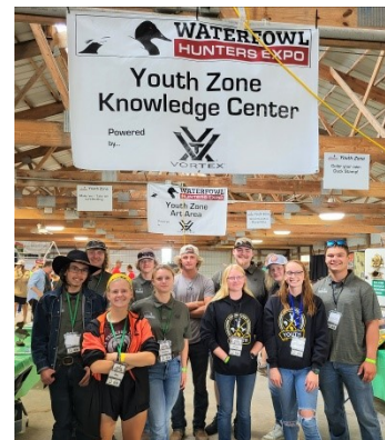
YCC delegates assisting the youth zone