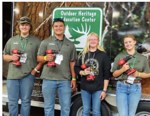
YCC delegates showing the donated drills used to assemble nest boxes