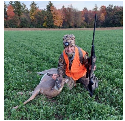
Brody, YCC delegates from Racine Co. pictured during the 2022 youth hunt.