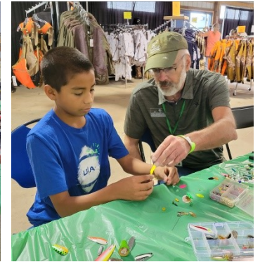
Learning station featuring lure making and fly tying