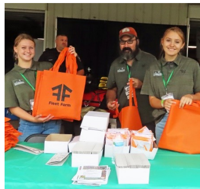
Filling bags with prizes and information about the YCC