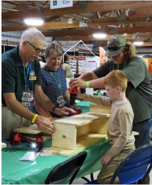
Wood duck nest box construction

Individual youth and families enjoyed all aspects of the Youth Zone, and loved getting to spin the prize wheel upon completing activities in the youth zone.