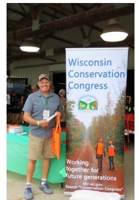
Youth zone welcome station