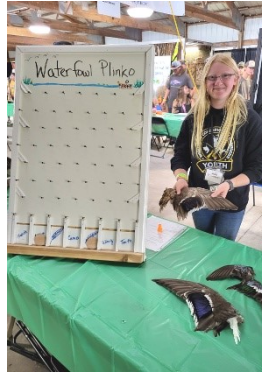
Plinko waterfowl trivia and biology station