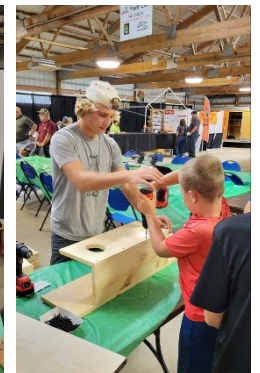
Assembling nest boxes