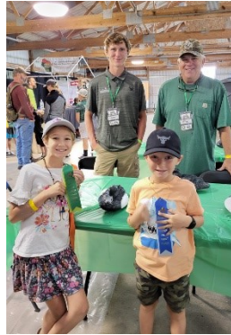
Duck decoy painting, first and second place artists